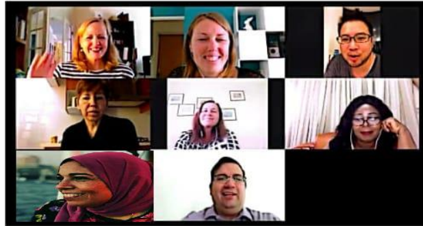
A snapshot of our BCNet Check-In Meeting held on Zoom, on May 08, 2020