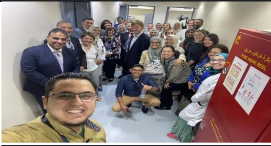
A visit by the Portuguese Minister of Health and his delegation to the Faculty of Medicine and the Ain Shams Medical Research Center to enhance international cooperation