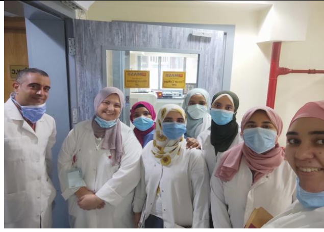
MUST University students doing their graduation projects