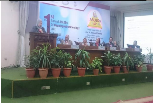
Presentation of stem cells and its application of 1 st Annual ASLGDs of hepatogastroenterology unit internal medicine.