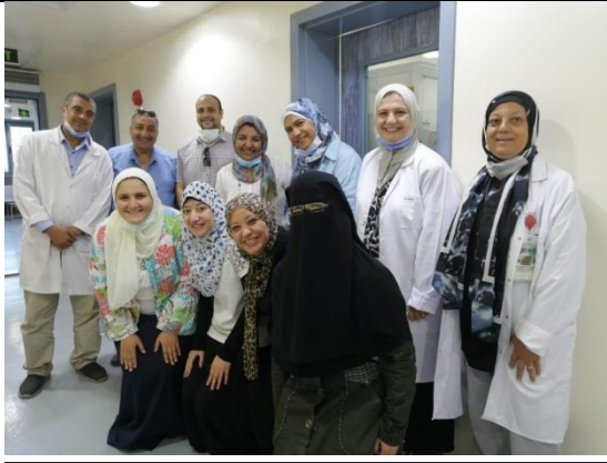
Hands on workshop ECEEM , Theodor Bilharz Research institute (TBRI) and VACSRA