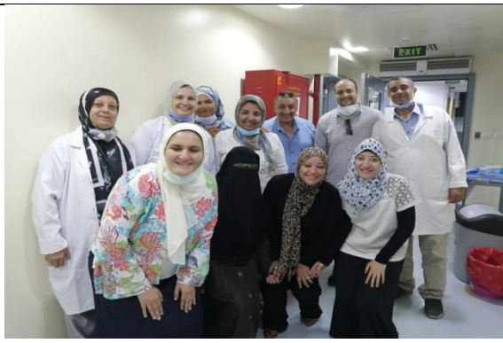
A scientific day with workers from different research places to exchange experiences ECEEM , Theodor Bilharz Research institute (TBRI) and VACSRA